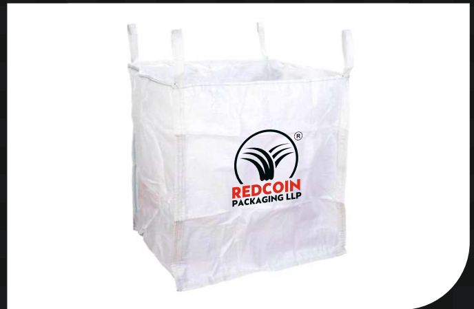
Jumbo Bags / Sacks