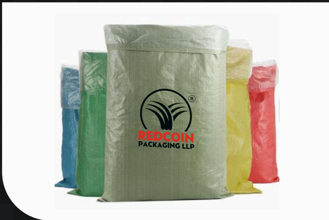
Polypropylene (PP) Laminated Bags / Sacks